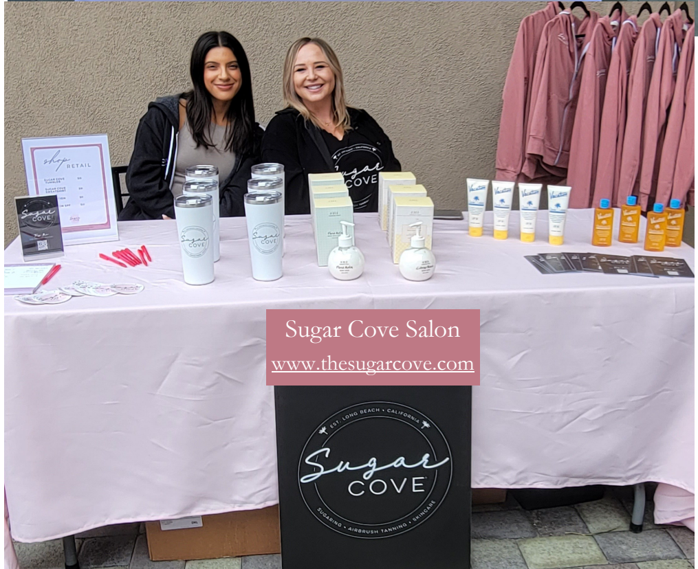
Sugar Cove Salon