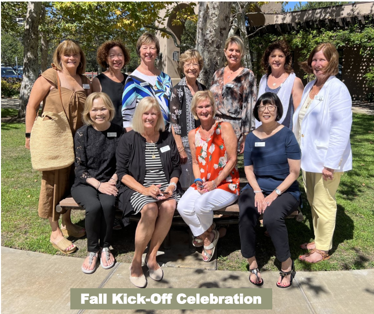
Fall Kick-Off Celebration