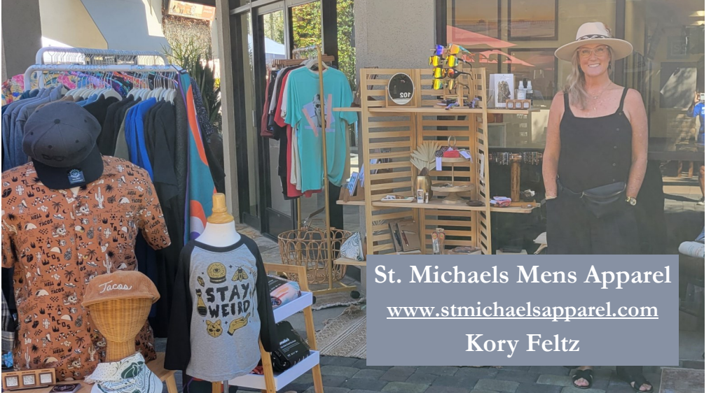
St. Michaels Mens Apparel