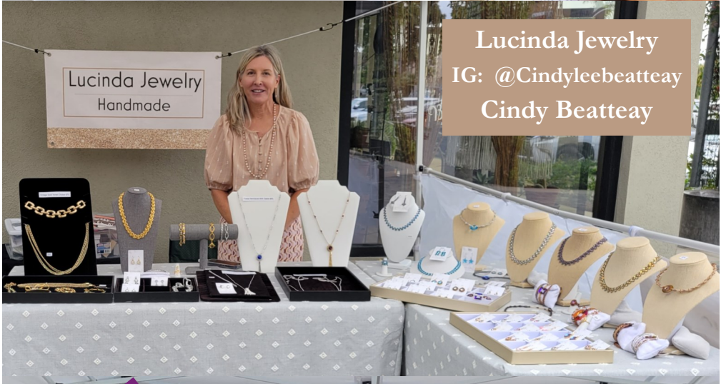
Lucinda Jewelry Handmade