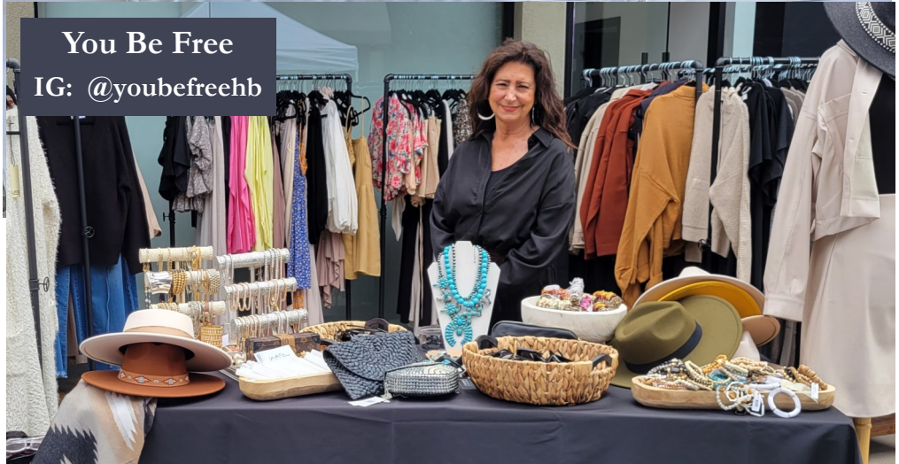
You Be Free IG: @youbefreehb